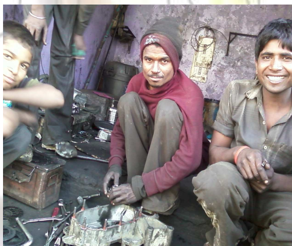
Fig. 1: Some automobile workers with dirty hands and clothes

Although there is a considerable variation in the toxic concentration levels, there is no metal ion (including those which serve vital functions in biological systems) that is tolerated at high concentration [8].